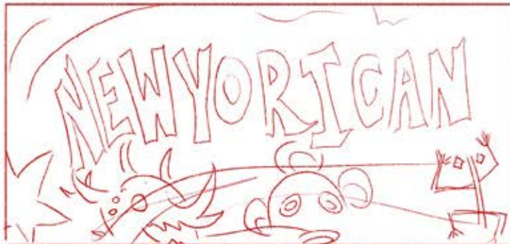
MILES + ARTY 'NEWYORTICAN' COLLAB MURAL; BASE OF ARTY'S MORE TRADITIONAL STYLE W/ OVERLAYS OF MILES' CONTEMPORARY FLAIR