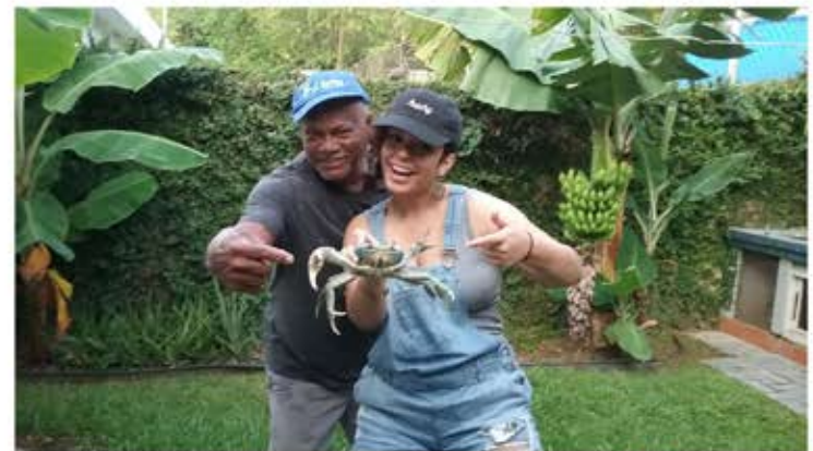
COOKIN' CRABS HE CAUGHT ↴