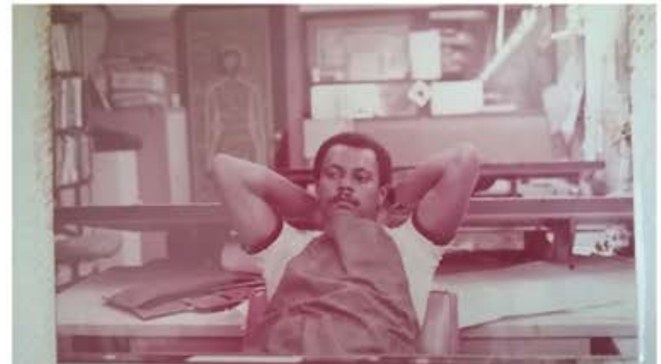
ABUELO AS AN ARCHITECTURE STUDENT ↴