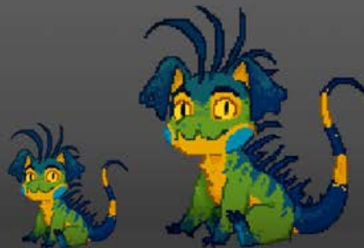
<- ENLARGED FOR DETAIL